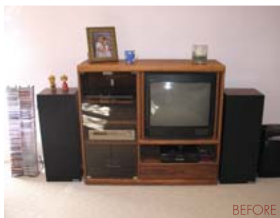
LEFT: The Schneider's oak entertainment center (complete with 1970s speakers and turntable) was in need of a good overhaul.